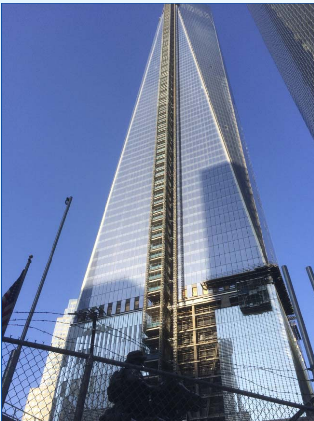
Figure 2 - A Trylon tower

Seafaring men and women's daily routines include watch standing, ever increasing paperwork when off watch, preparation for increased inspection regimes, deck work and engine room maintenance and preservation all with reduced manning and the call for MLC (maritime labor convention requirements for reduced hours). It's as if those in charge who have retired from going to sea and now work ashore and making policy are far removed from the current realities of the modern