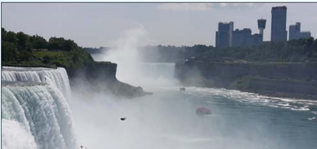
Figure 1 - American and Canadian Falls overlooking the Maid of the Mist boats

A similar theme can be said to reside in my own hometown of Niagara Falls, NY (NF), known to many as one of the seven wonders of the world; not so much maritime education, but education in general, new technologies and just plain recapturing the former glory the Falls used to have in its earlier years as the place to go and having a strong regional cultural heritage. I can attest first hand there are many issues in NF regarding a myriad of standards and requirements for education, culture and money matters. In this newsletter, I'd like to try and draw a few parallels between MET and my hometown not by speaking directly or too hard about maritime issues as this hadn't seemed to have work that well before; besides, talking about Niagara Falls and linking it to maritime is a good diversion, Figure 1 refers.