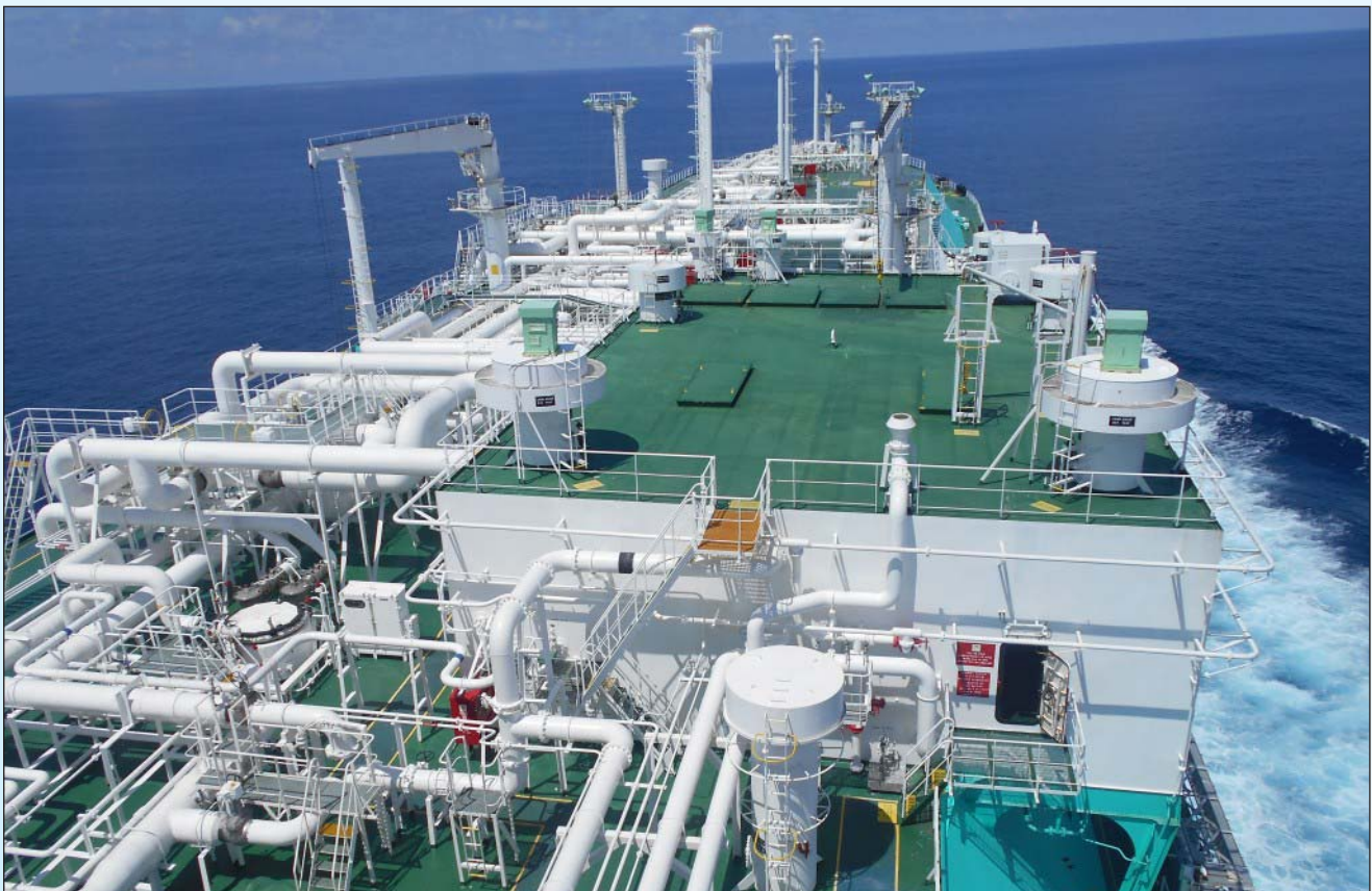
Figure 1 - LNG vessel

Technology was supposed to be a game changer for the maritime industry, making a number of shipboard reporting requirements much easier and giving the seafarer some relief from the complex nature of today's maritime environment; yet it seems one finds that much of the same paperwork requirements that initially led to the adoption of new technologies and automated processes onboard for reporting requirements back to the home office in the first place still has to be done, not because there's anything necessarily wrong with the electronic data or reporting format, but merely because home office requirements continue to also require the previous manual reporting ; double the requirements and work. Additionally, in many other cases ashore there also appears to be multiple silos of operations and requirements (i.e., lack of coordination and efficiency) sending a