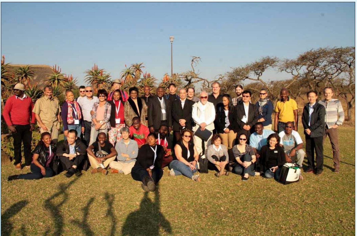
A group photo of some of the IMLA '23 delegates at the Tala Private Game Reserve