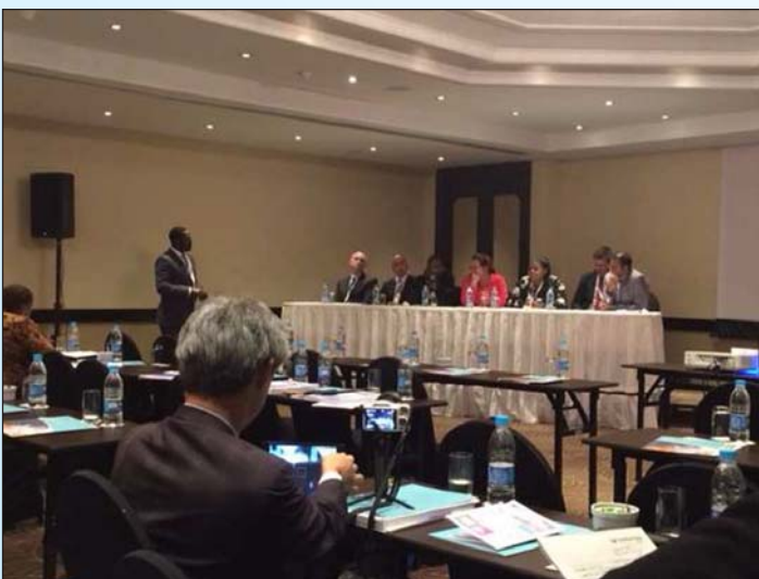
One of the IMLA '23 Panel Discussions

The final session took place at Tala private game reserve - located in the hills of a peaceful farming community, close