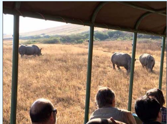
Delegates viewing Rhino on the game drive

The IMLA Conference was very well organised and hosted by the staff of the Durban University of Technology. The program contained a wide variety of topics to inform and stimulate discussions and provided delegates with an excellent opportunity to meet and network with colleagues in the international MET industry.