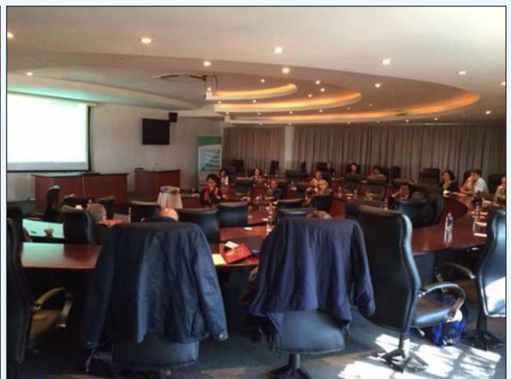
Final Session at Tala Game Reserve conference venue