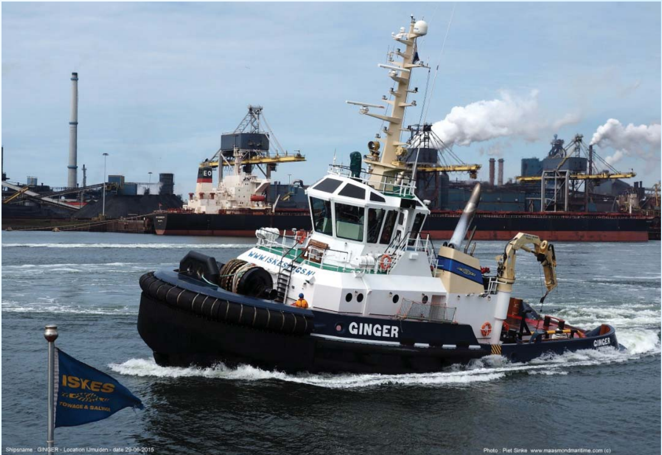
Shipsname - GINGER - Location IJmuiden - date 29-06-2015