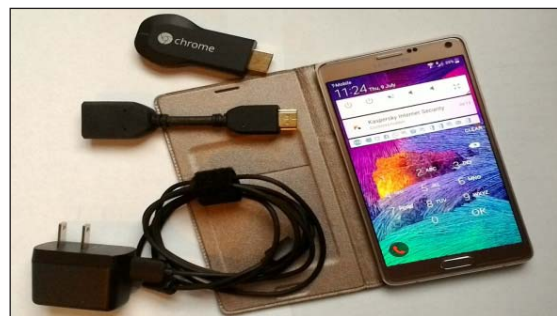
Figure 2 - Google Chromecast, extension and power cord

Need to make a presentation and don't have a projector? Have a large screen display TV and a Smart Phone? On the move, travel a lot and can't carry a large amount of weight or computer equipment because of travel weight restrictions. Maybe you're at home and don't feel like being chained to your desktop computer or computer room, try Google Chromecast. The Google Chromecast HDMI dongle fits right into the back of the TV's HDMI port and instantly turns your TV into an internet ready large screen display using your mobile device; tested with an Android device.